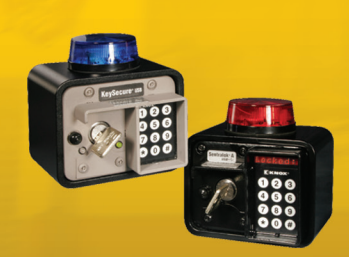
Master Key Retention